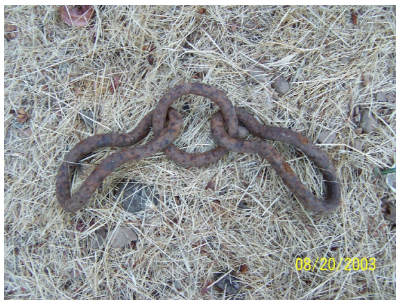
Applegate Trail Ox Yoke Chain Artifact: On Verified Class 3 Segment OR-JA-00-35-06-2- Silvestri Property