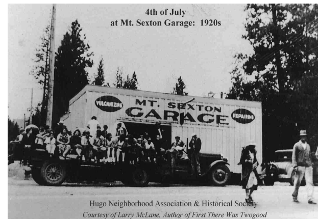
Mt. Sexton Garage

1941 Almost two miles of the Pacific Highway near the top of Mt. Sexton was being rebuilt during the fall of 1941. It was finished the next summer along with other sections for a total of almost seven miles rebuilt from north of Mt. Sexton south to Jump-off Joe Road. The new route eliminated much of the narrow, twisting highway in the area. It also bypassed Art Erickson's Service Station.