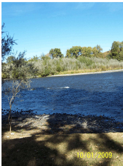
IV Ford No. 1

The photographs shows the dam regulated water flow at 1,290 cubic feet per second (ft 3 /s) on October 1, 2009. The lowest recorded water flow prior to the construction of Lost Creek Reservoir was 606 ft 3 /s in 1968. It was estimated that the flow at the 1847 ford was between 700 - 800 ft 3 /s .