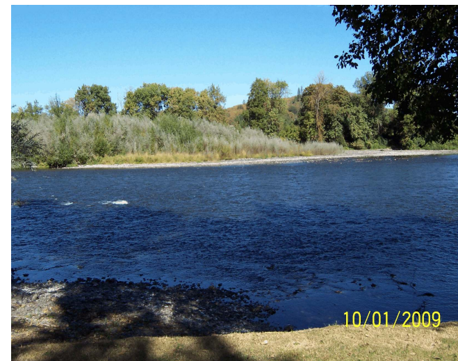
1846 IV Ford No. 1