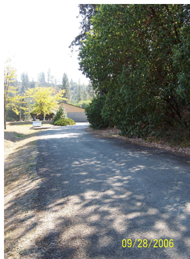
JA-7 In Chip & Seal Road

C.S. 110-68 Bearing & Distance Without a correction JA-7 is 3.54' north of the NE property corner monument of Tax Lot 200 (NE TL Monument); (C.S. 110-68 = 2,651.46' + 438.67' + 536.33' = 3,626.46' north of Sec Cor (13, 14, 23,24). 3,630' - 3,626.46' = 3.54'. With a 21.9' correction JA-7 is 25.44' north of NE TL Monument.