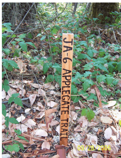
Applegate Trail JA-6 Marker

JA-6 located between 197' - 208' south of W 1/4 corner. The 2006 GPS location was 24' from the average May 12, 2010 C.S.